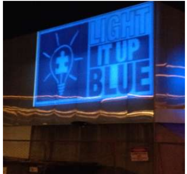
Makers' Workshop - Burnie

It is not known what causes autism. Much research is being done to try to find out more. At this point it is believed to result from changes to brain development which may be