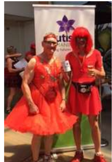
Hobart Hash—Red Dress Run